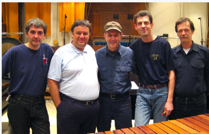
Steve Reich with Amadinda

M allet Quartet is scored for two vibraphones and two five octave marimbas. I had never written for five octave marimbas extending down to cello C. On the one hand I was delighted to have the possibility of a low bass and on the other hand apprehensive since just slightly too hard a mallet that low can produce noise instead of pitch. Eventually, after a bit of experimentation, this was well worked out.